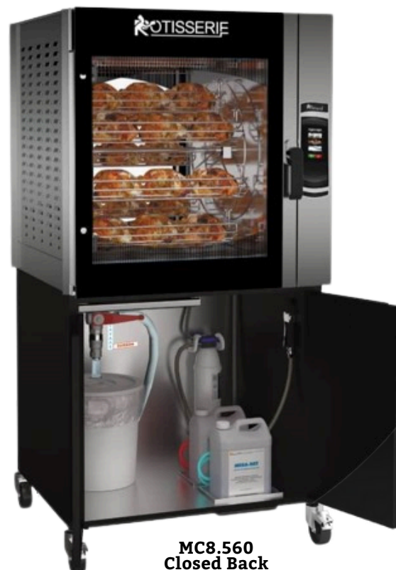
MC8.560 Closed Back